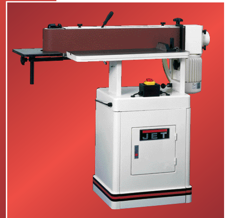
EHVS-80 without oscillation