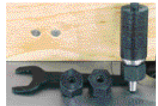
Accessory: Exchange milling spindle 30 mm (Stock-no. 10000251)