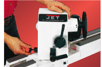
Pivoting headstock quickly turns and locks to facilitate outboard turning and to provide better vision during internal machining