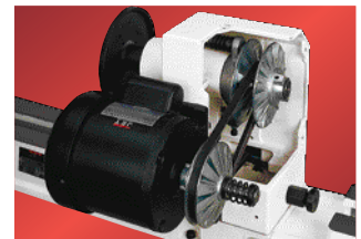
Various spindle speeds ranging from 450–2500 rpm