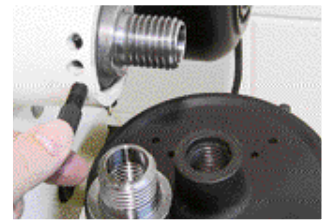
Headstock division every 15°, adapter M 33 x 3.5 standard