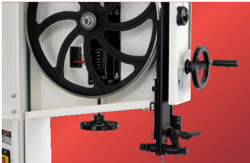
Balanced cast iron wheels with curved, long-life PU coating. Blade tension scales on rear and front (JWBS-18DX)