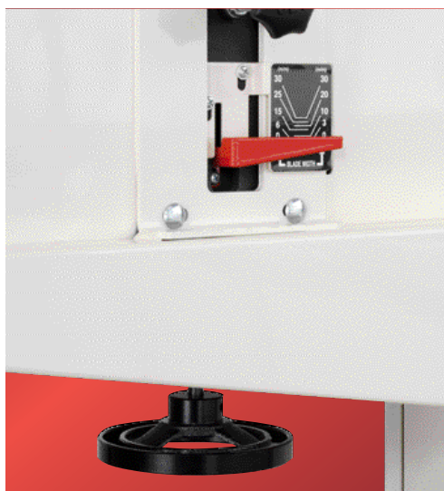
Large, blade tension handwheel and precise blade tension scale