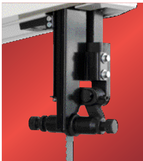
Upper and lower precision blade guides