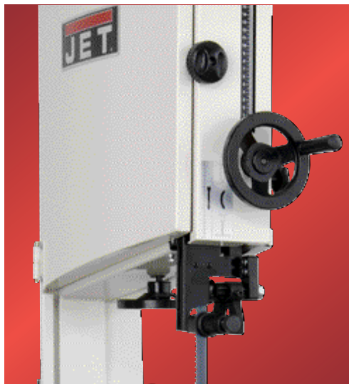
Precise and simple adjustment of the cutting height using large-size handwheel