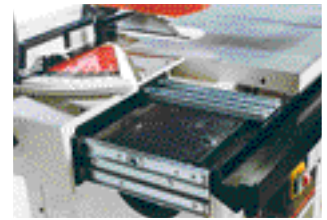
Sturdy cast iron sliding table with linear guide and adjustment screws for easy, accurate set-up.