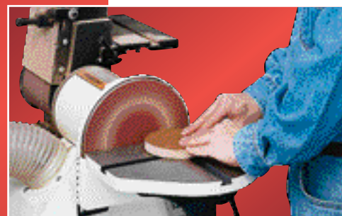
Disc sanding with circular sanding unit