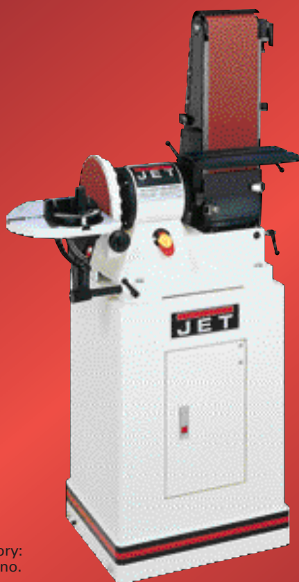
Shown with accessory: closed stand (stock-no. 708597)