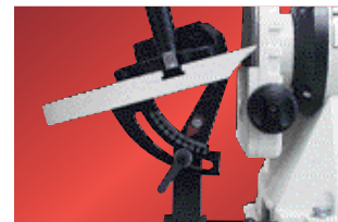
Tiltable cast iron table with stops at 90° and 45°