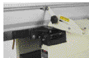
Double guided jointing fence, tilts at the table