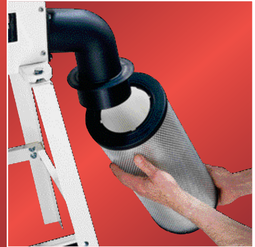
Canister filter with elbow fitting optional as accessory

Shown with accessory: open stand (stock-no. 708438)