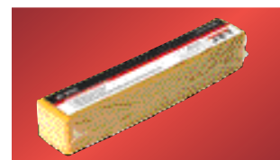
Accessory: Abrasive cleaning stick (Stock-no. 60-0505)