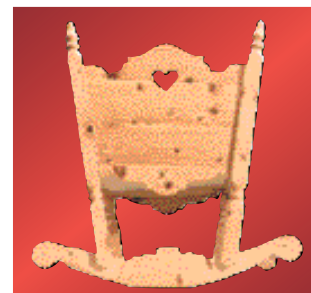
Simple sanding of curved pieces