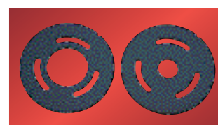
2 table inserts with suction slits and 2 table inserts with oblong recess to tilt table standard