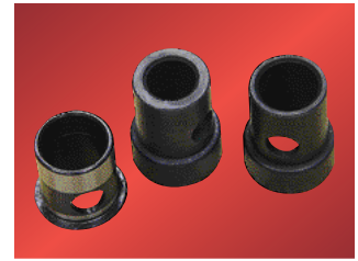
Adapter for chisel in different standard shank diameters (5/8", 3/4", 13/16")