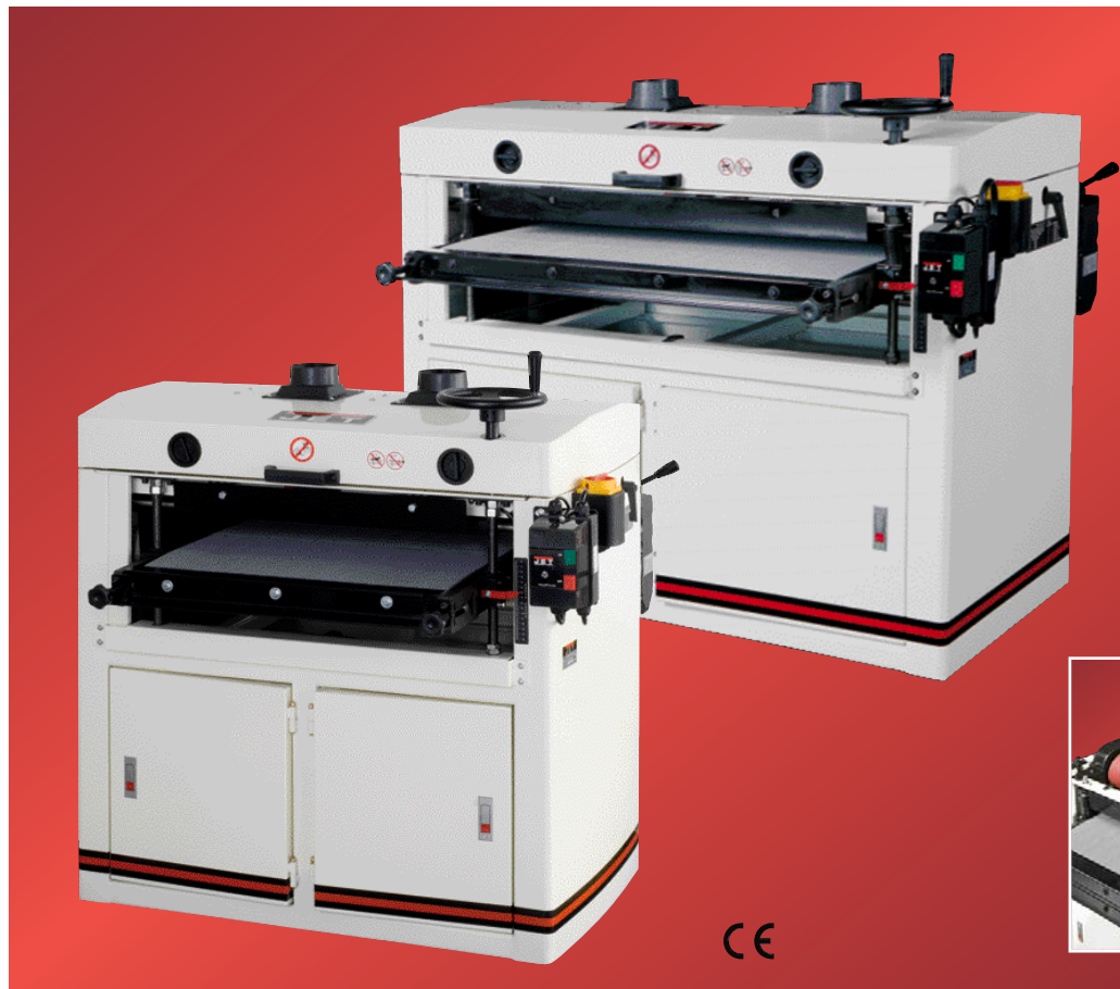
2 sanding drums for roughing and finishing in one operation