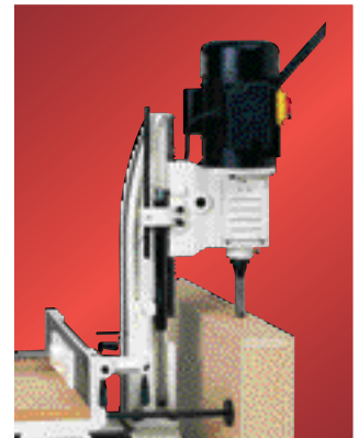
Work in a 180° tilted condition