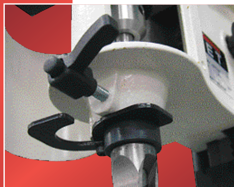
Built in chisel-to-bit spacer