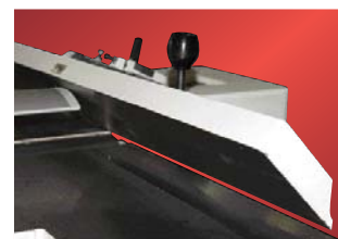
Jointing fence tilts \pm 45^\circ – for maximum protection, also when cutting chamfers