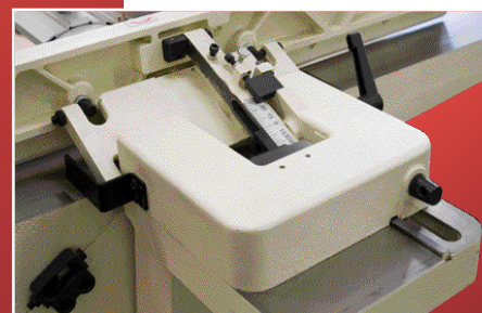
Easy-to-operate cast iron jointing fence