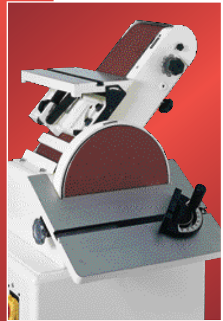
All components tiltable