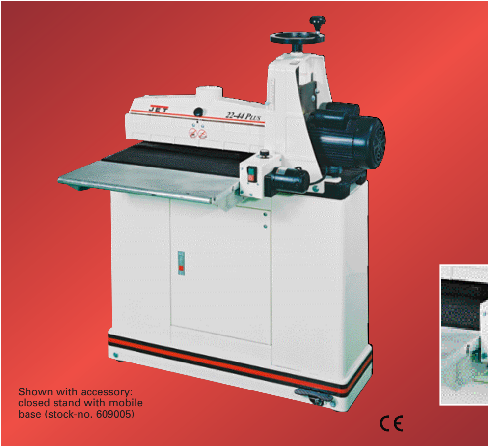
Shown with accessory: closed stand with mobile base (stock-no. 609005)