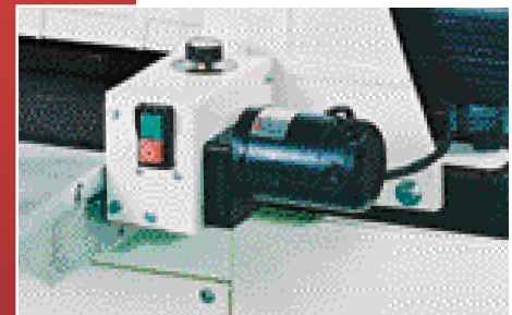
New, exclusive with Sand Smart