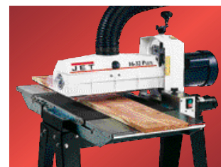
Sand up to 405 mm in one pass