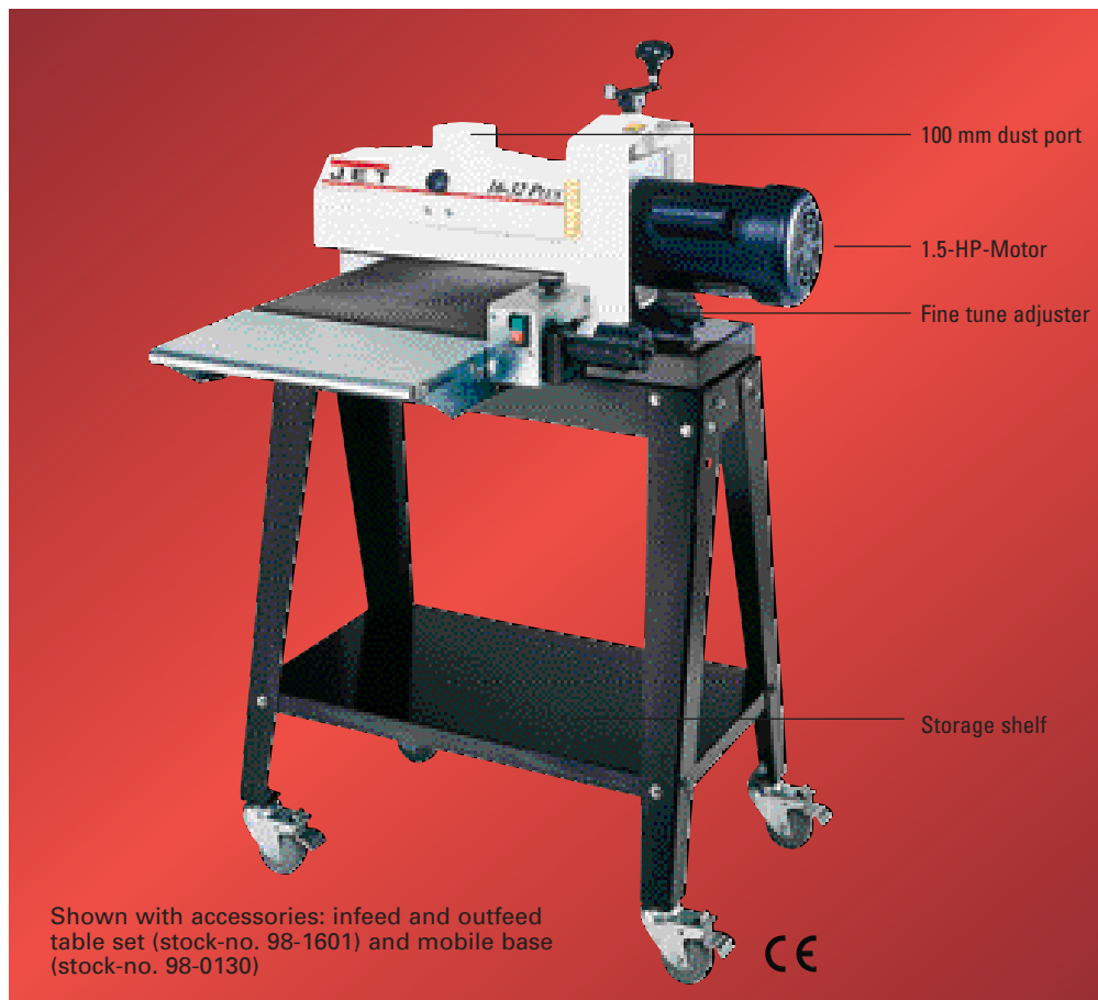
Shown with accessories: infeed and outfeed table set (stock-no. 98-1601) and mobile base (stock-no. 98-0130)