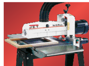
Sand up to 810 mm in two pass