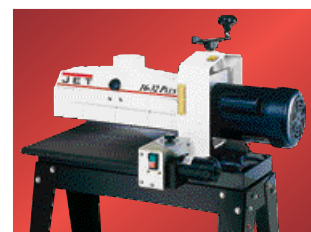
75 mm thickness capacity