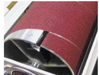
Patented quick tensioning system to fix the abrasive strips