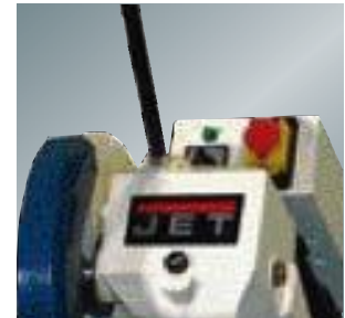
400V versions with 2 cutting speeds

Shown with accessory: Closed stand (Stock number 50000215 for MCS-275 Stock number 50000225 for MCS-315)