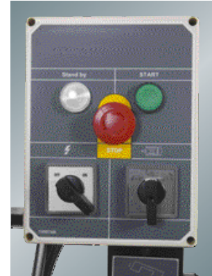
2 blade speeds via 2-step motor (MBS-910CS)