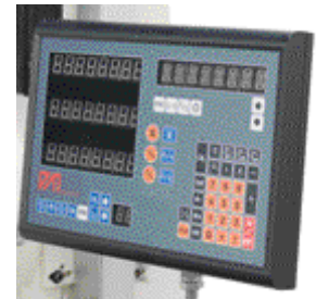
3-Axis digital readout (JMD-45PFD)