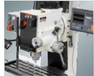
Linear scale with digital readout standard (JMD-45PF)