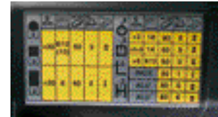
For each application optimum cutting speed can be adjusted