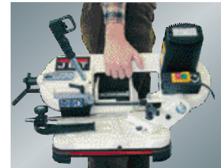
Easy to carry