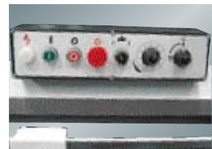
Central control unit