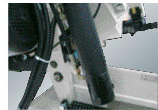
Stable machine construction