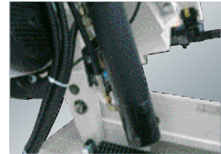
Stable machine construction