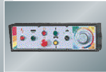
Convenient control panel