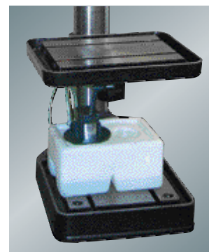
Integrated coolant system (GHD-27 / GHD-27PF)